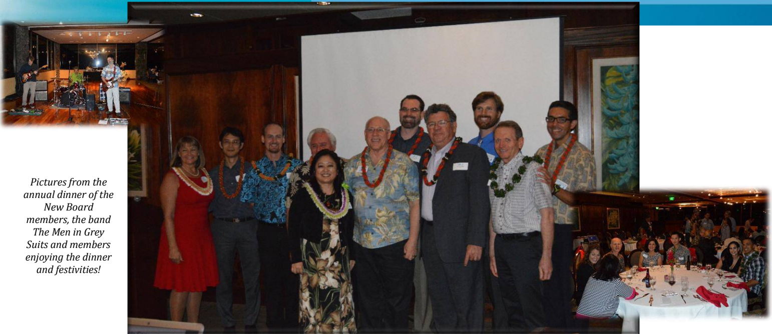
Pictures from the annual dinner of the New Board members, the band The Men in Grey Suits and members enjoying the dinner and festivities!